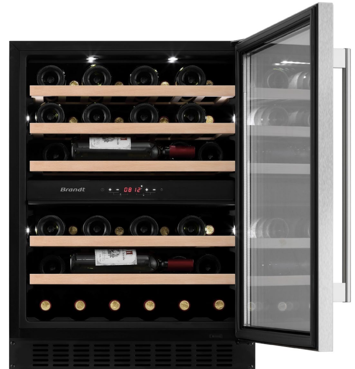
Loading plan based on traditional Bordeaux 750ml bottles